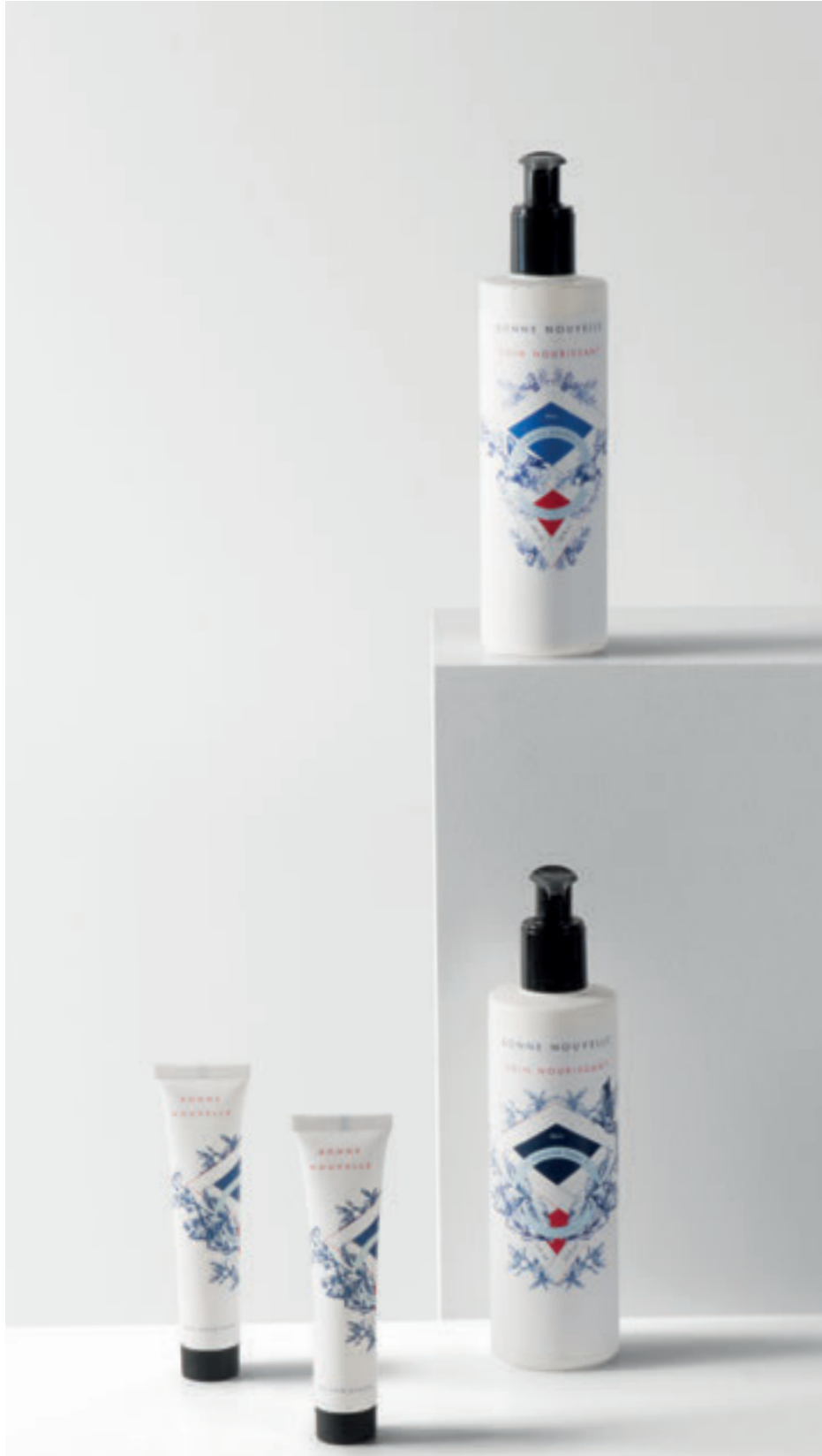
HOTEL PANACHE, Paris