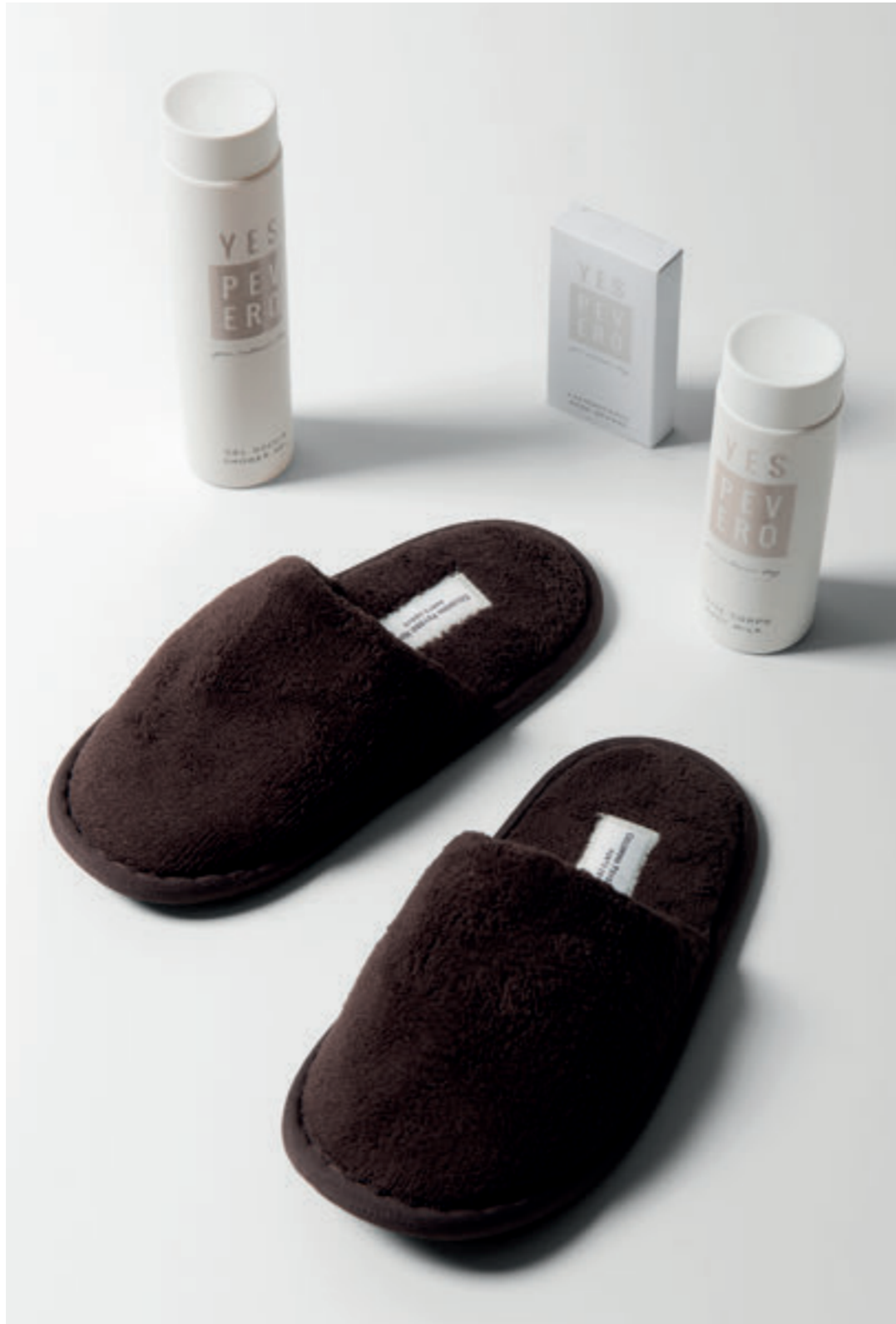
COLONNA PEVERO HOTEL, Porto Cervo