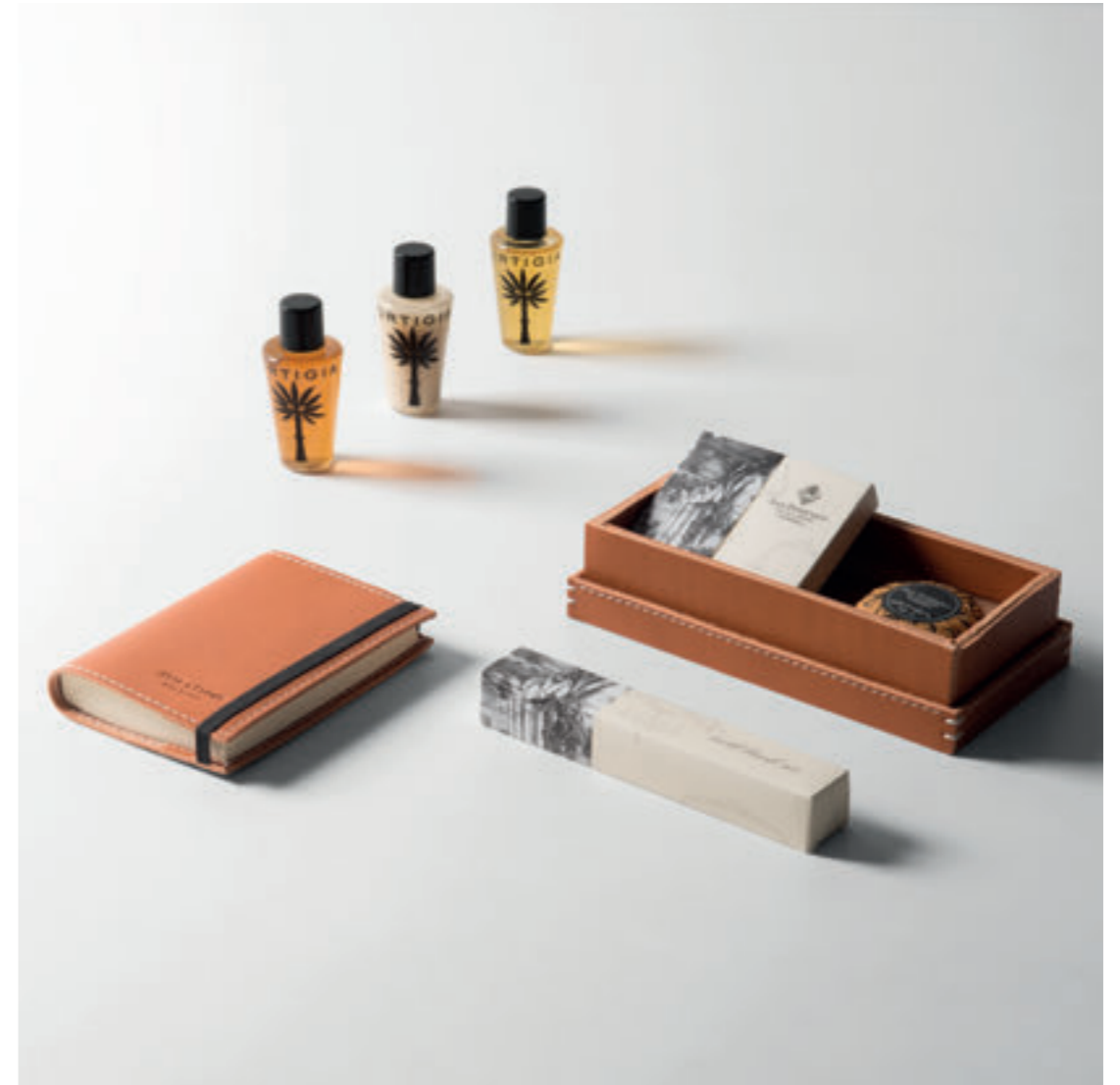
SAN DOMENICO PALACE HOTEL, Taormina