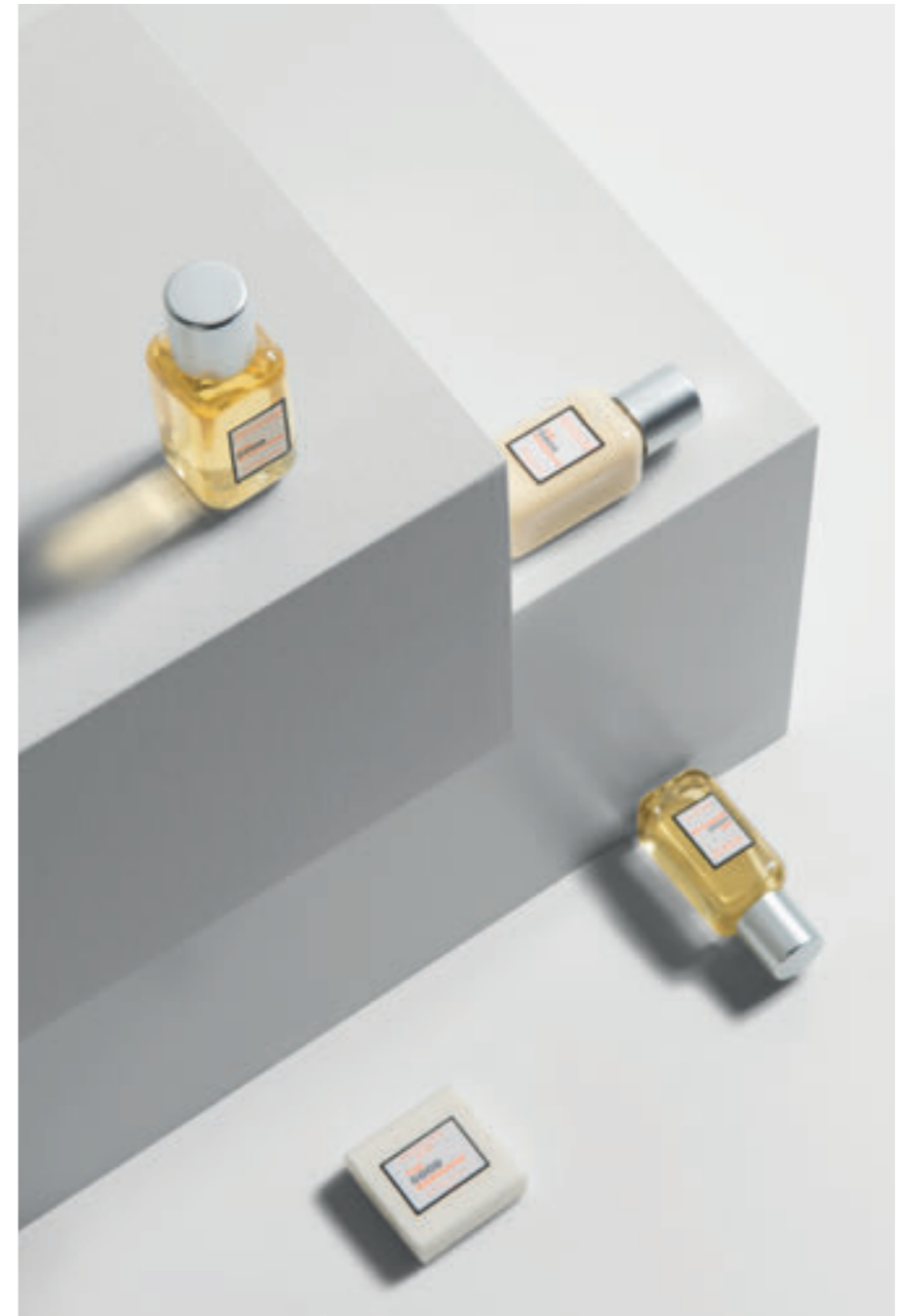
THE PENZ HOTEL, Innsbruck