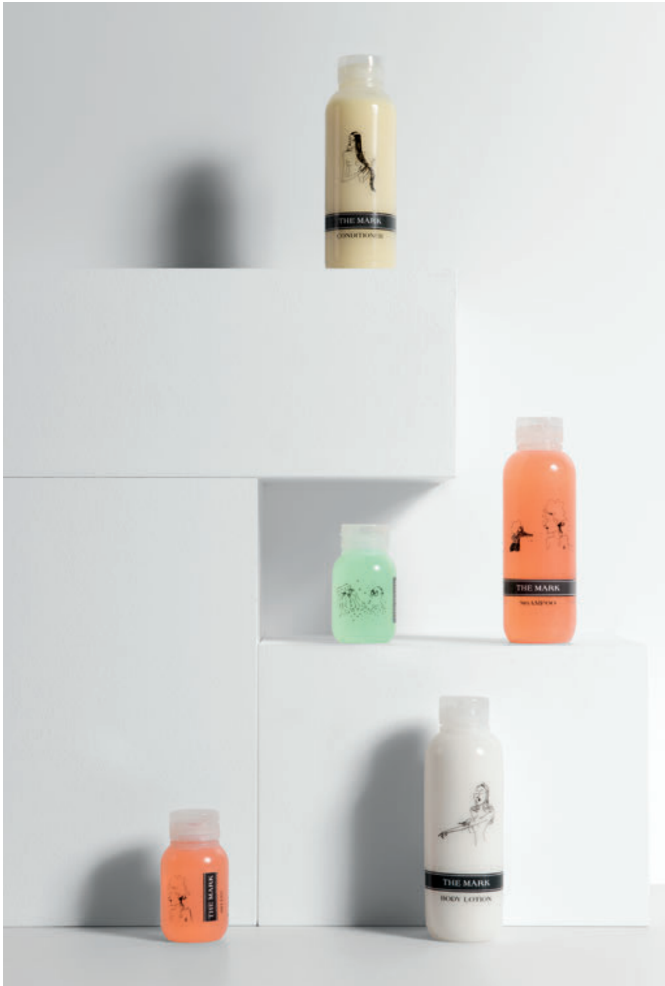
THE MARK HOTEL, New York