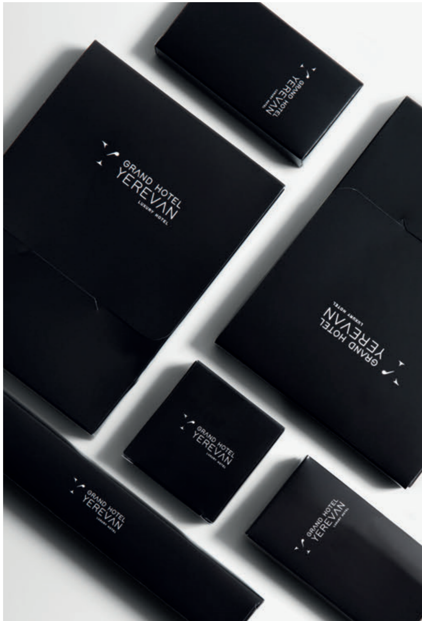
GRAND HOTEL YEREVAN