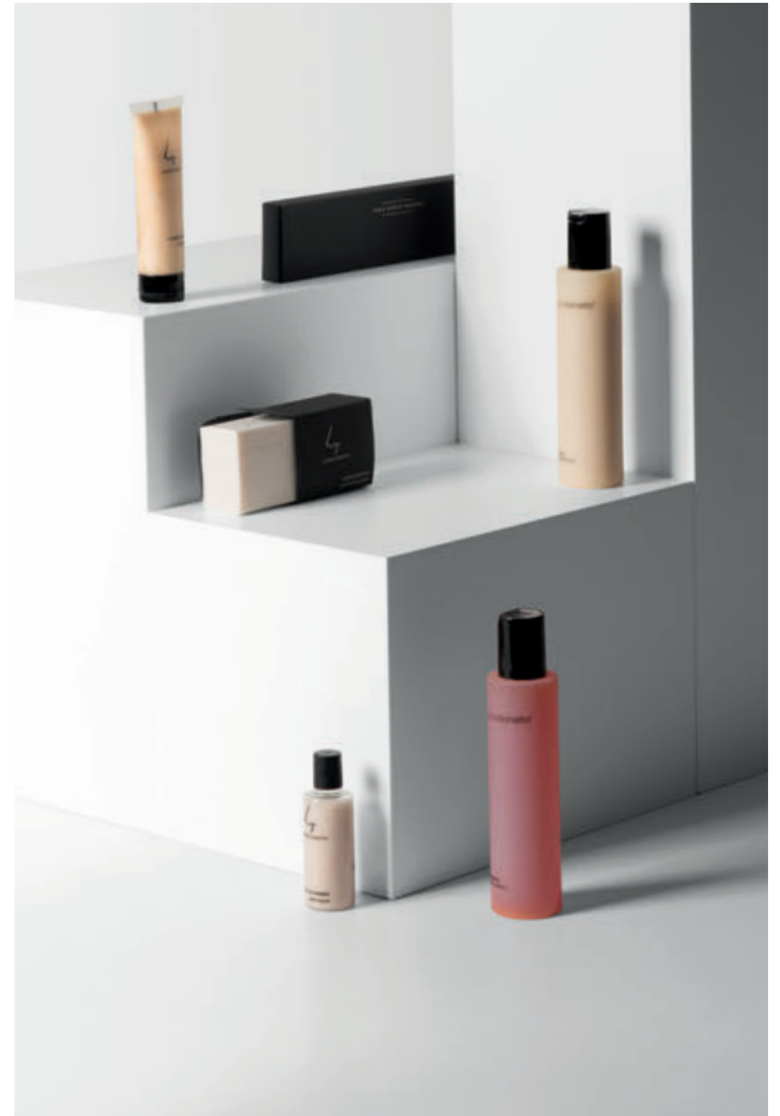
PARK HYATT MILANO