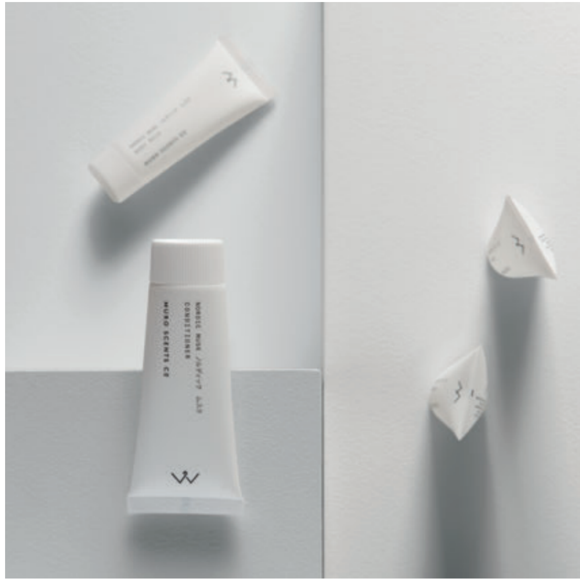
HOTEL J, Nacka Strand