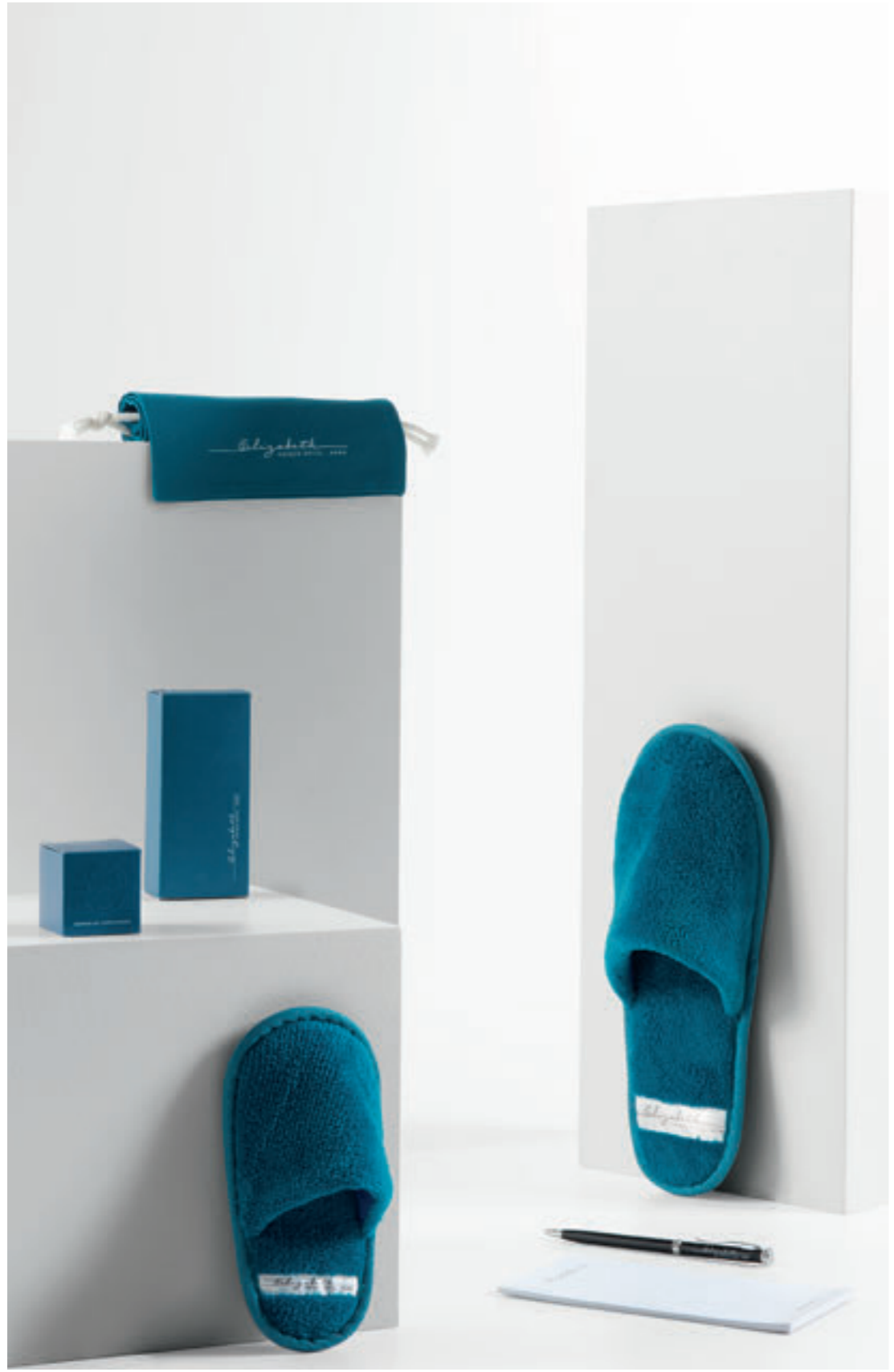
ELIZABETH UNIQUE HOTEL, Rome