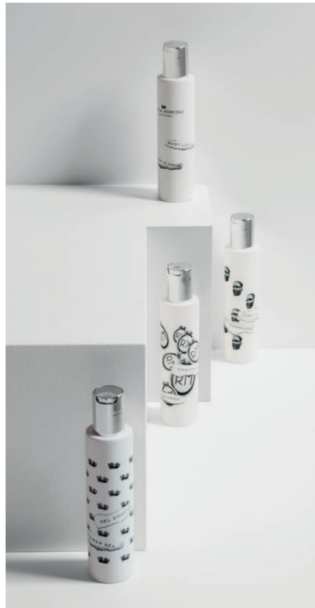
LE ROYAL MONCEAU - RAFFLES PARIS