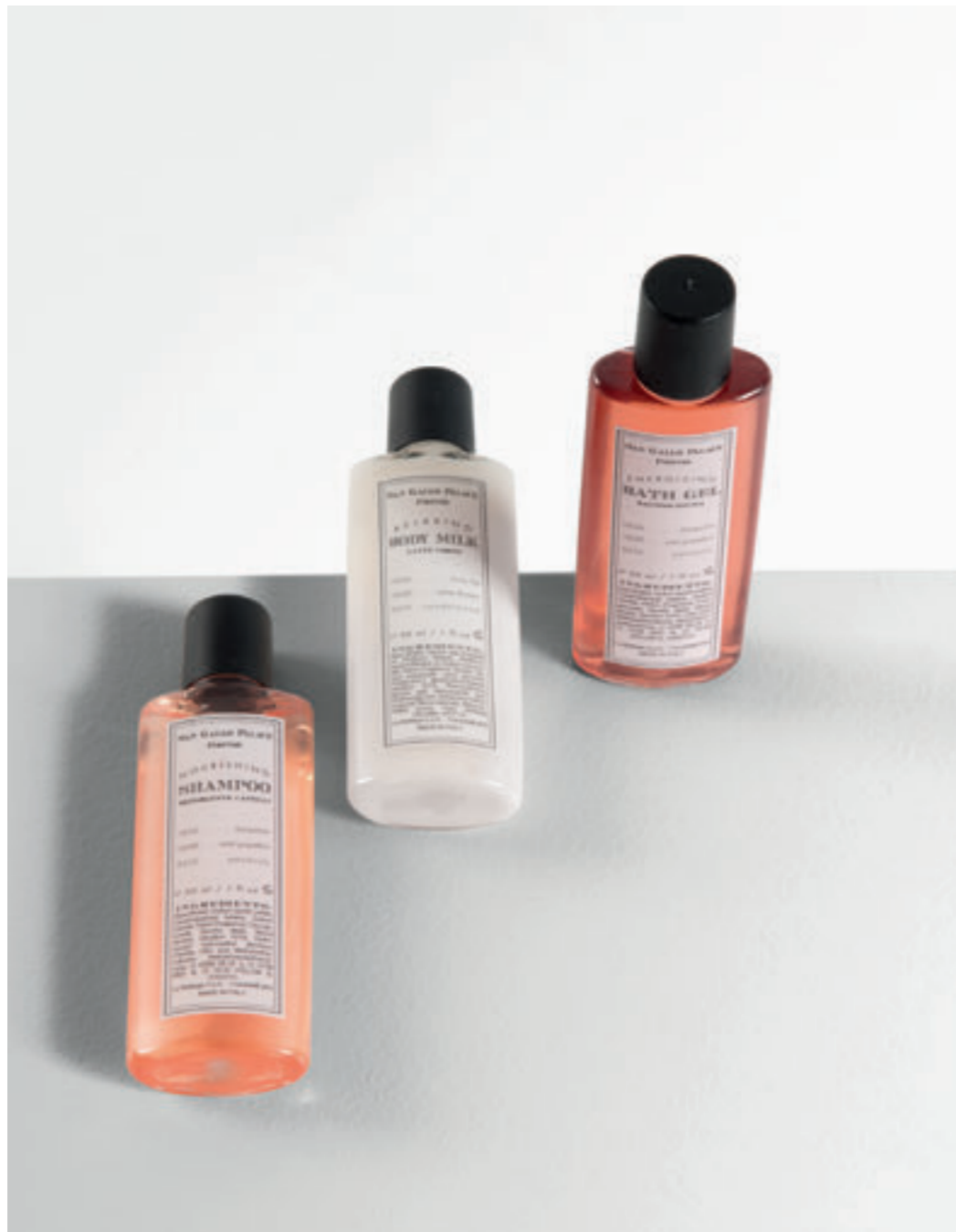
SAN GALLO PALACE, Florence