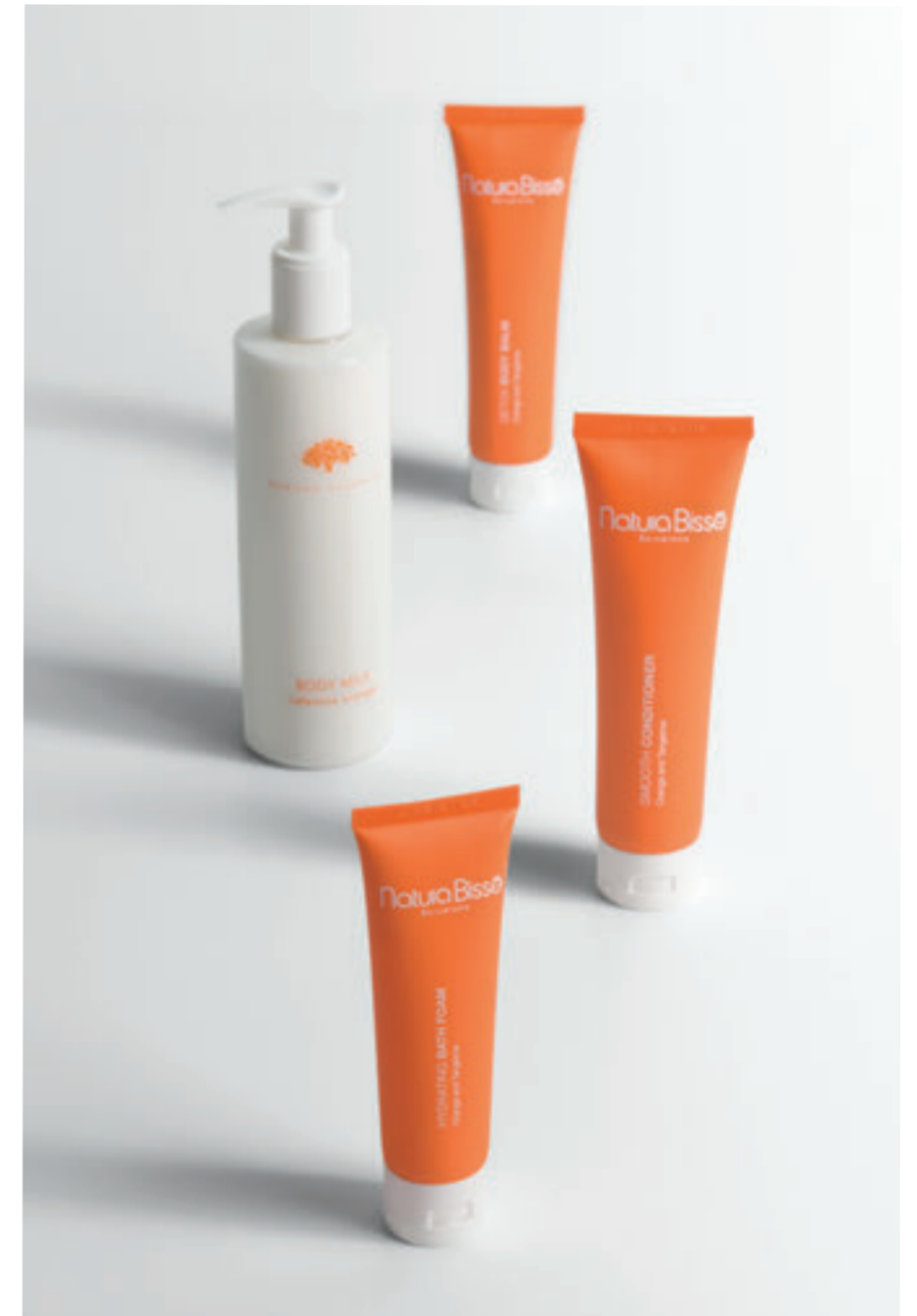
RANCHO VALENCIA RESORT & SPA, Rancho Santa Fe