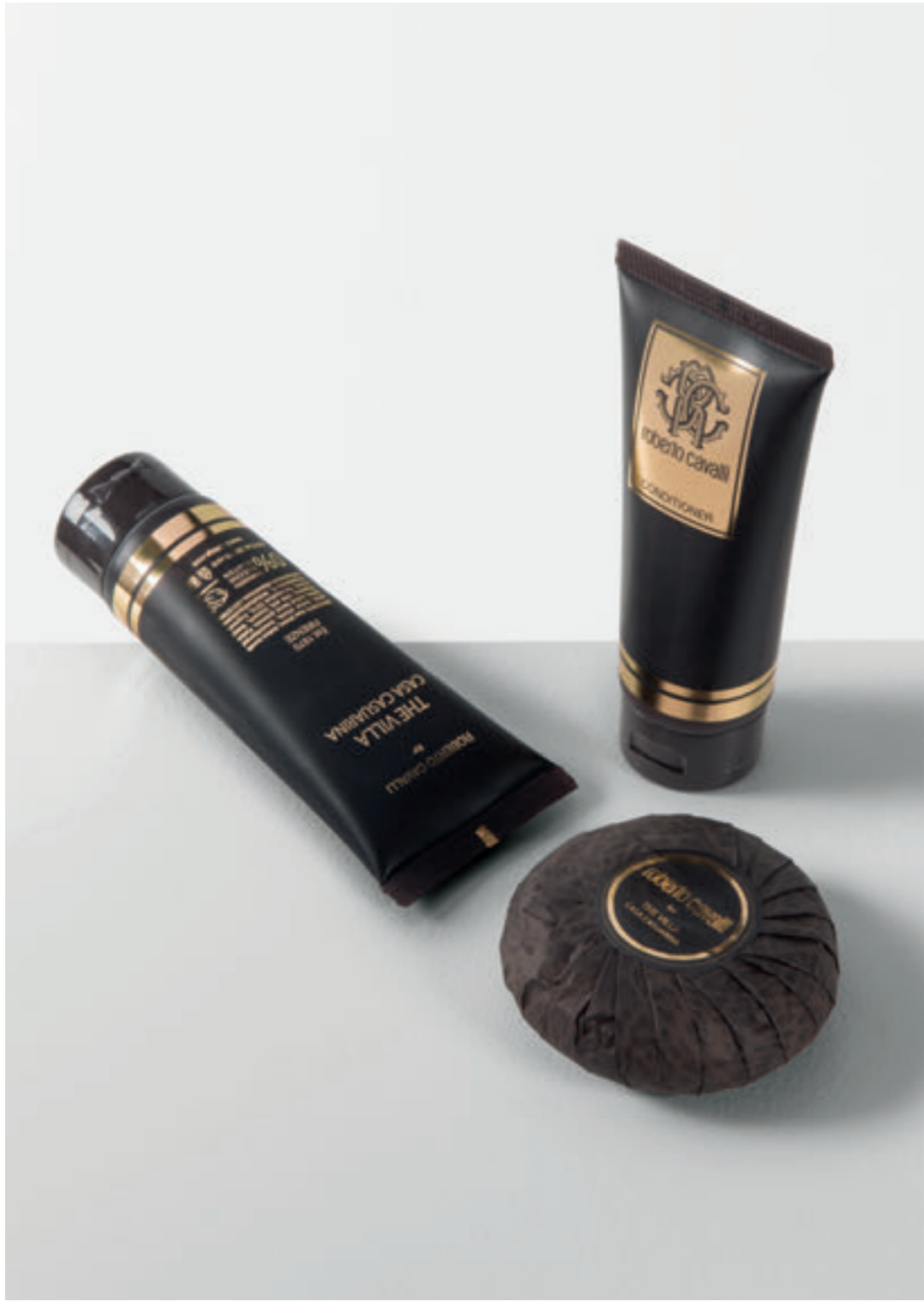
THE VILLA CASA CASUARINA, Miami Beach