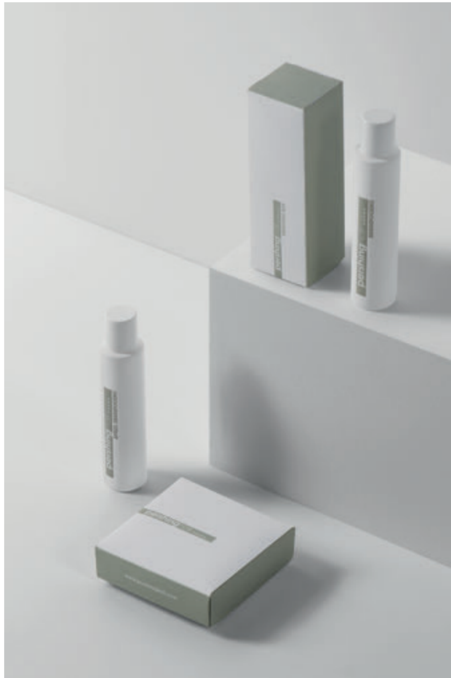
PERSHING HALL, Paris