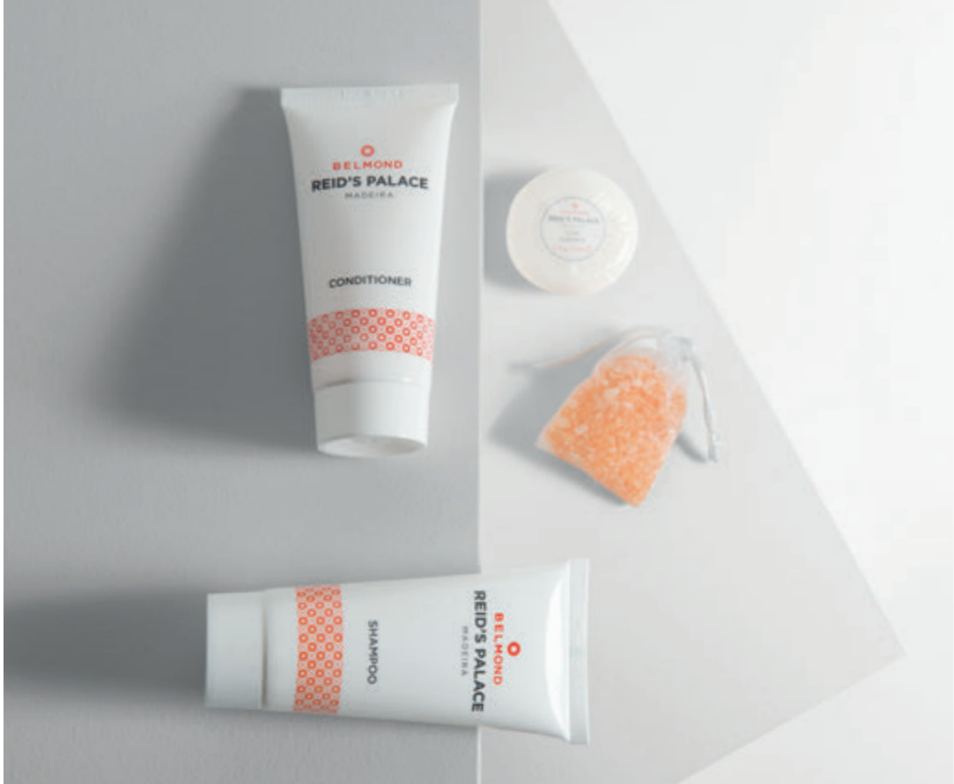
BELMOND REID'S PALACE, Madeira