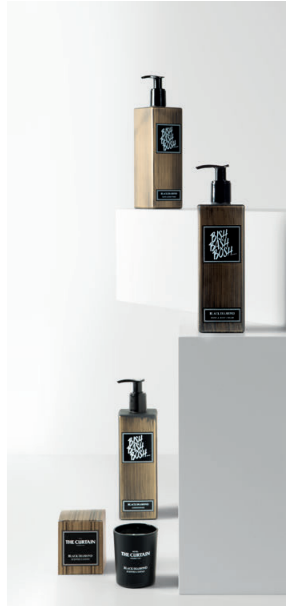
THE CURTAIN LONDON