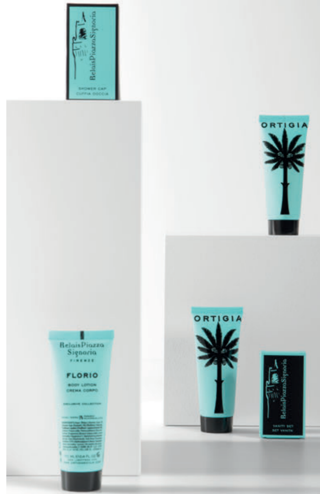
RELAIS PIAZZA SIGNORIA, Florence