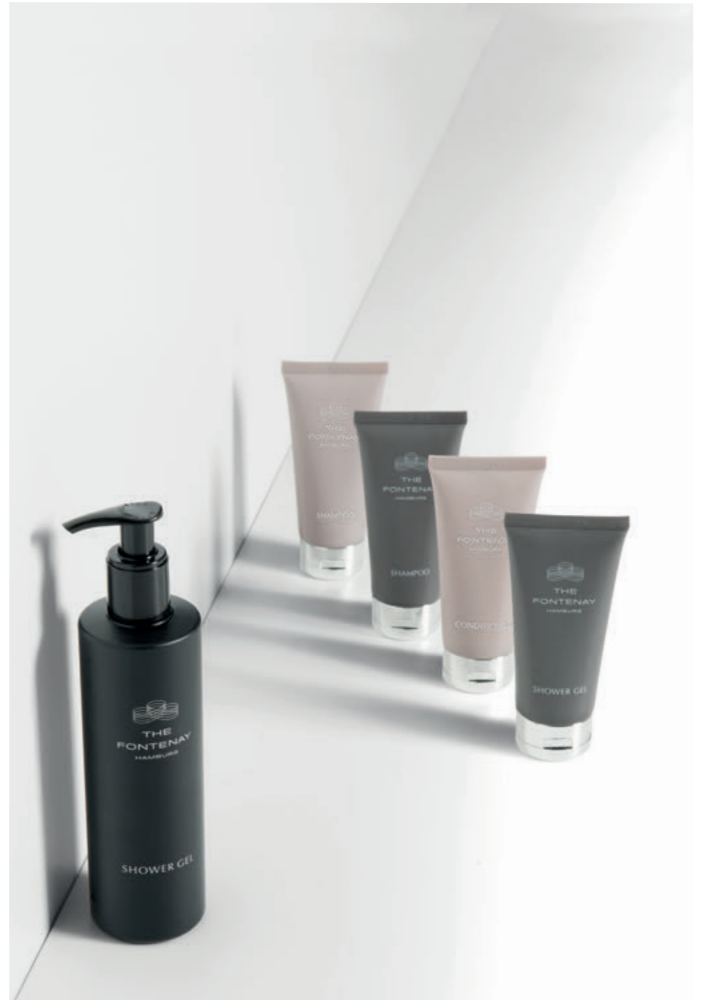
THE FONTENAY, Hamburg