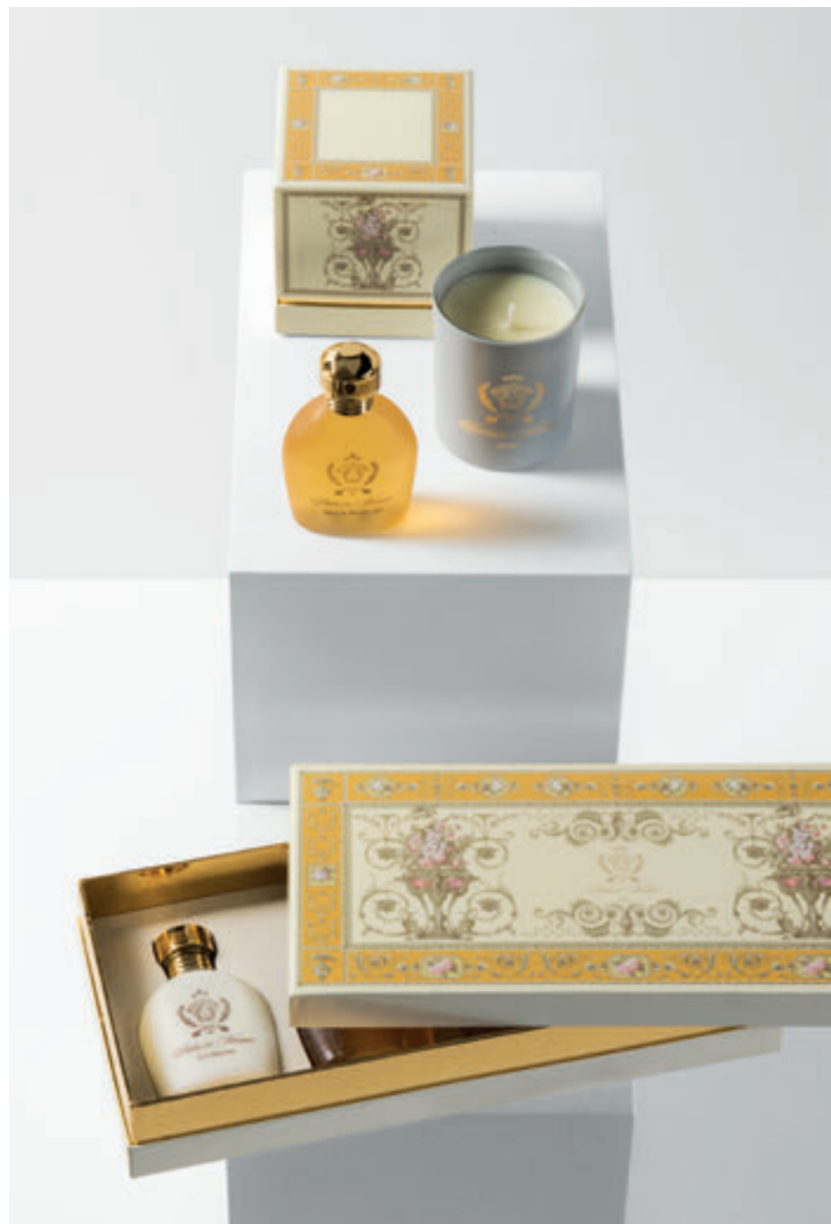
PALAZZO VERSACE, Dubai