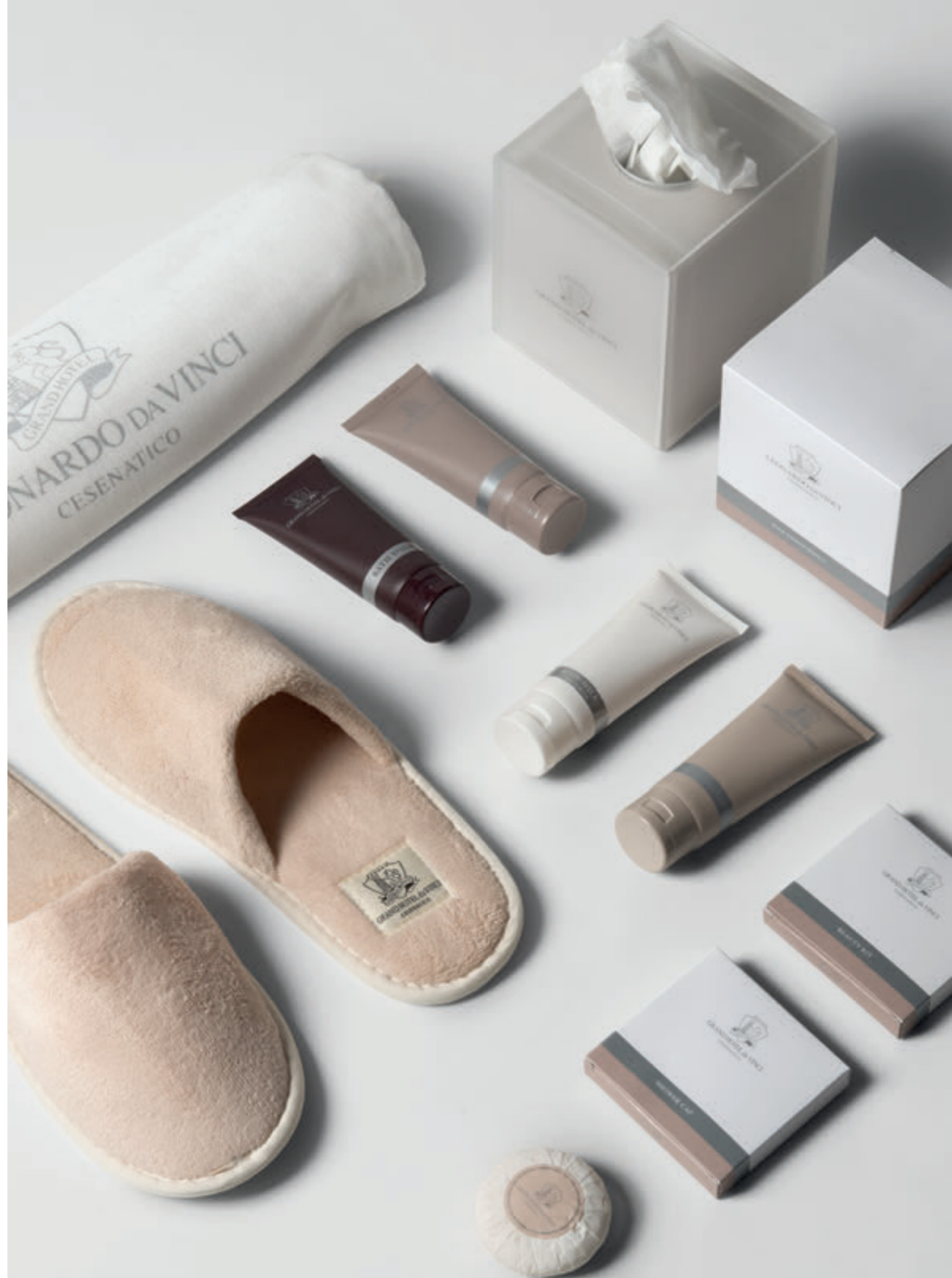
GRAND HOTEL DA VINCI, Cesenatico