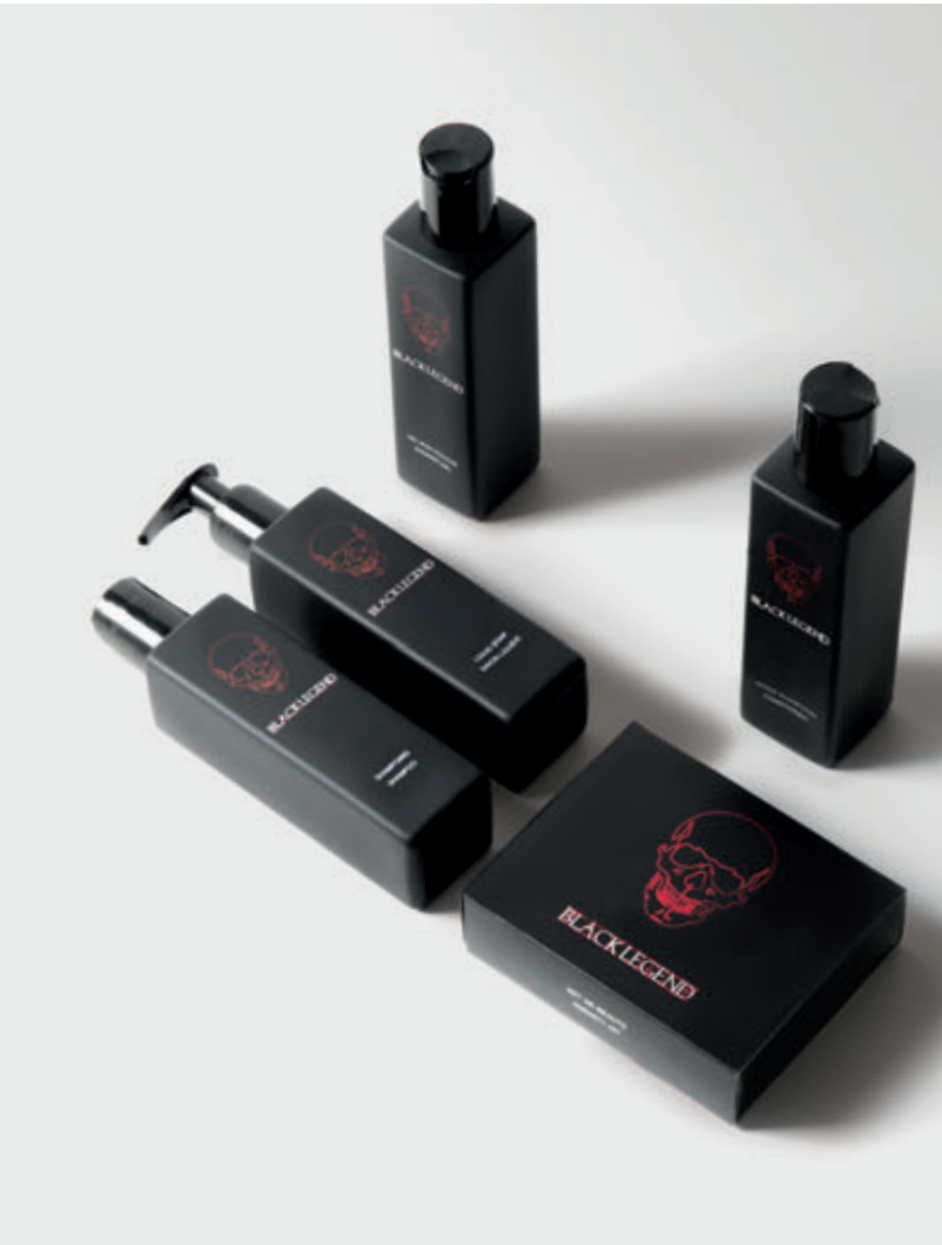
BLACK LEGEND YACHT