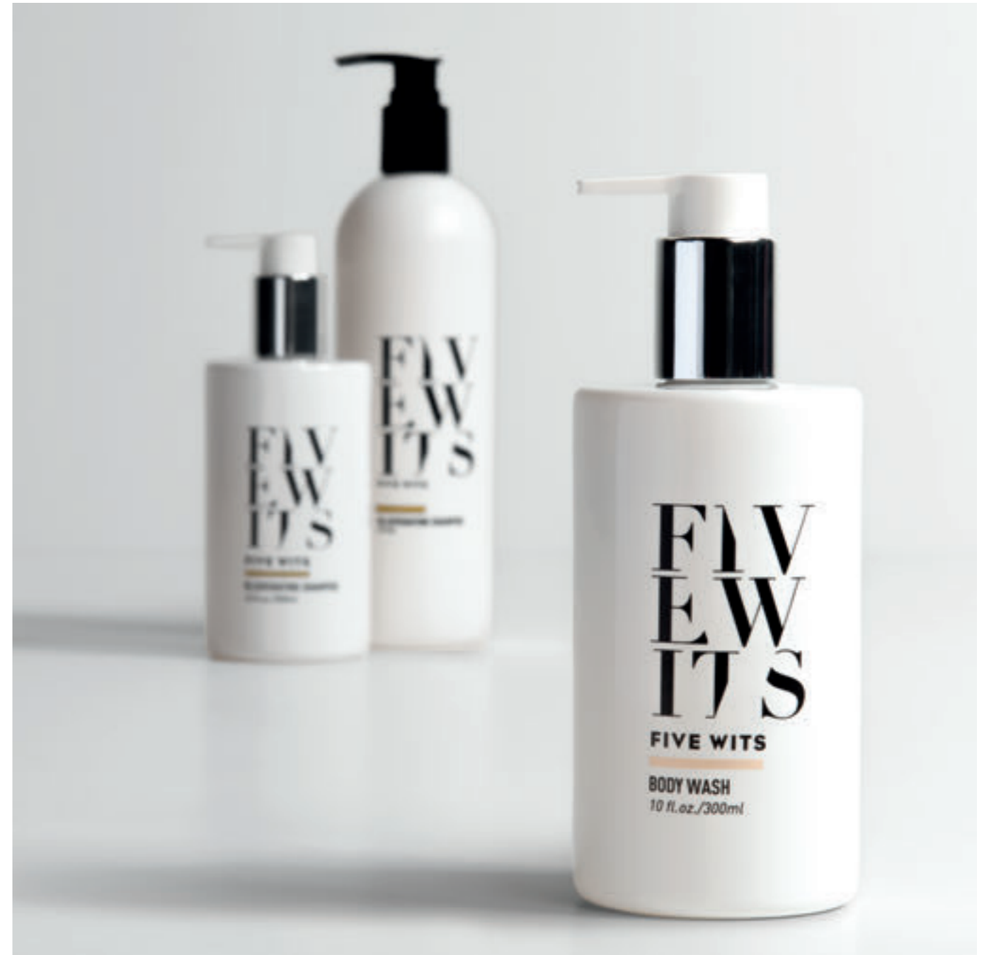
THE COSMOPOLITAN OF LAS VEGAS