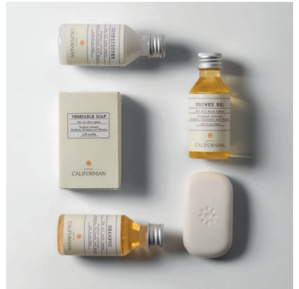
HOTEL CALIFORNIAN, Santa Barbara