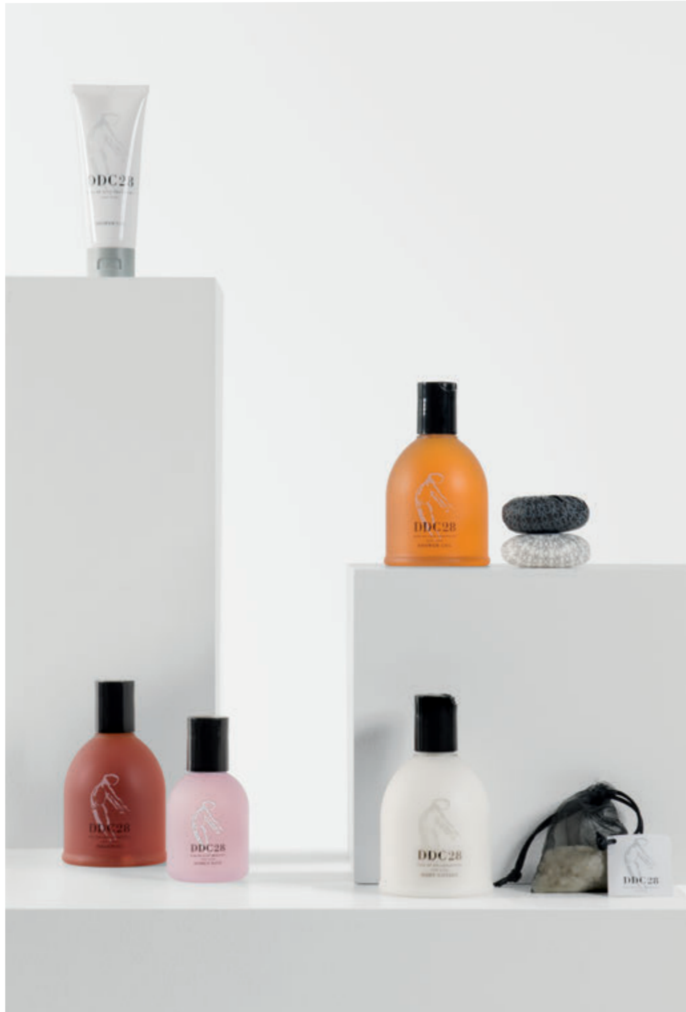
THE LOWELL HOTEL, New York