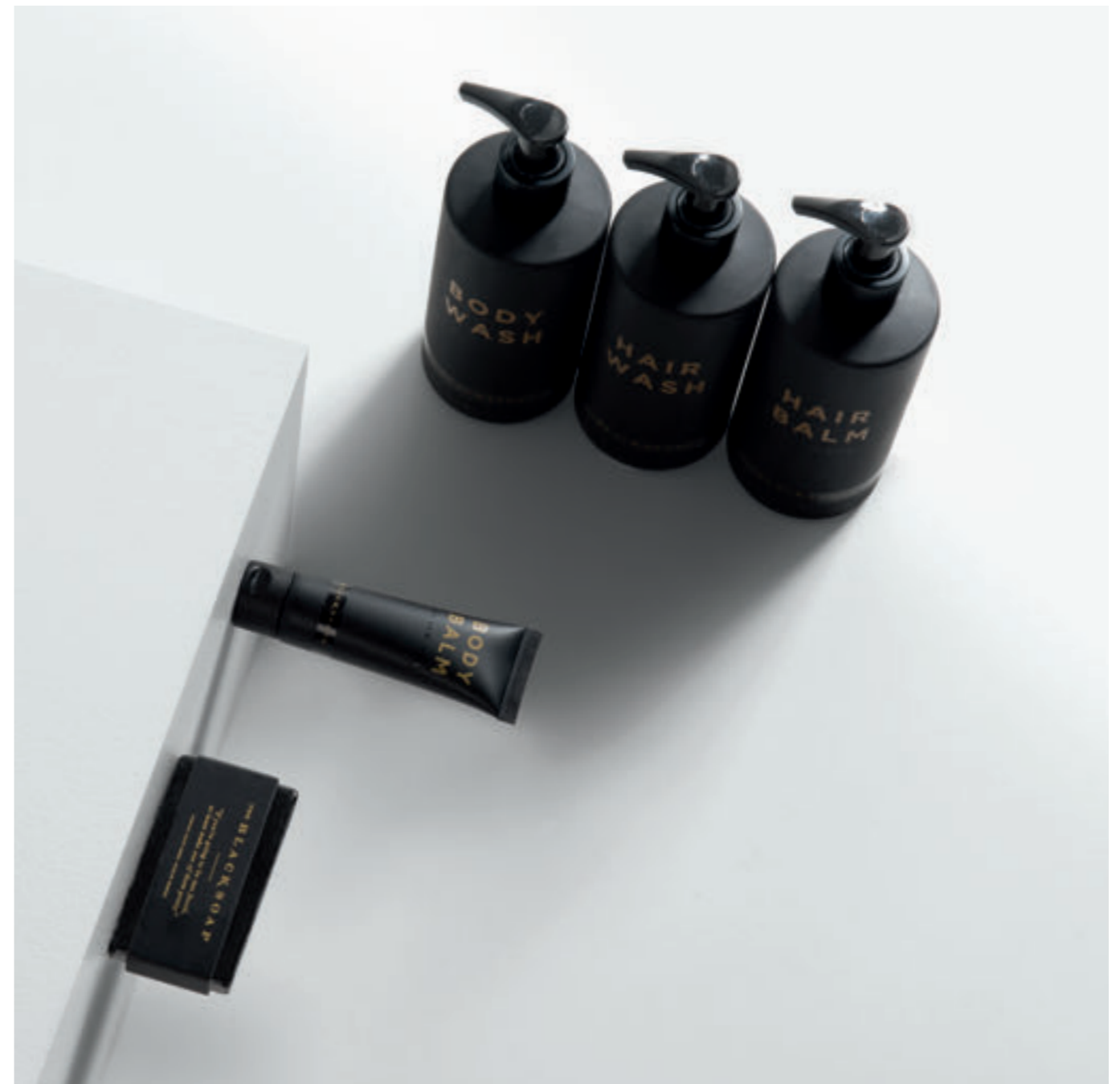
THE BLACKSTONE HOTEL, Chicago