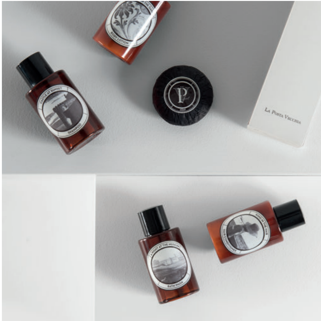
LA POSTA VECCHIA HOTEL, Ladispoli