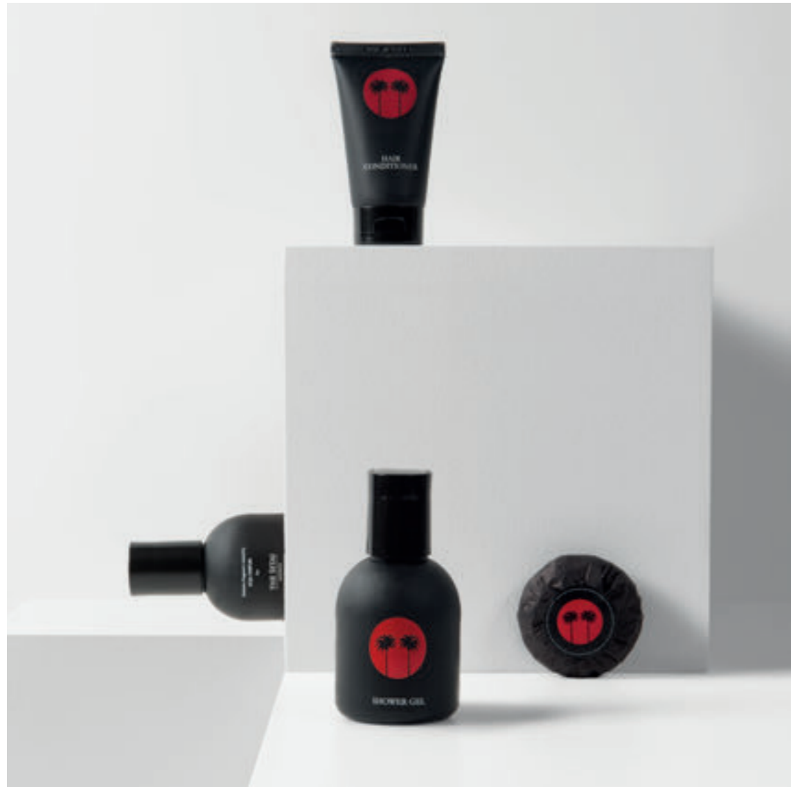
THE SETAL, Miami Beach