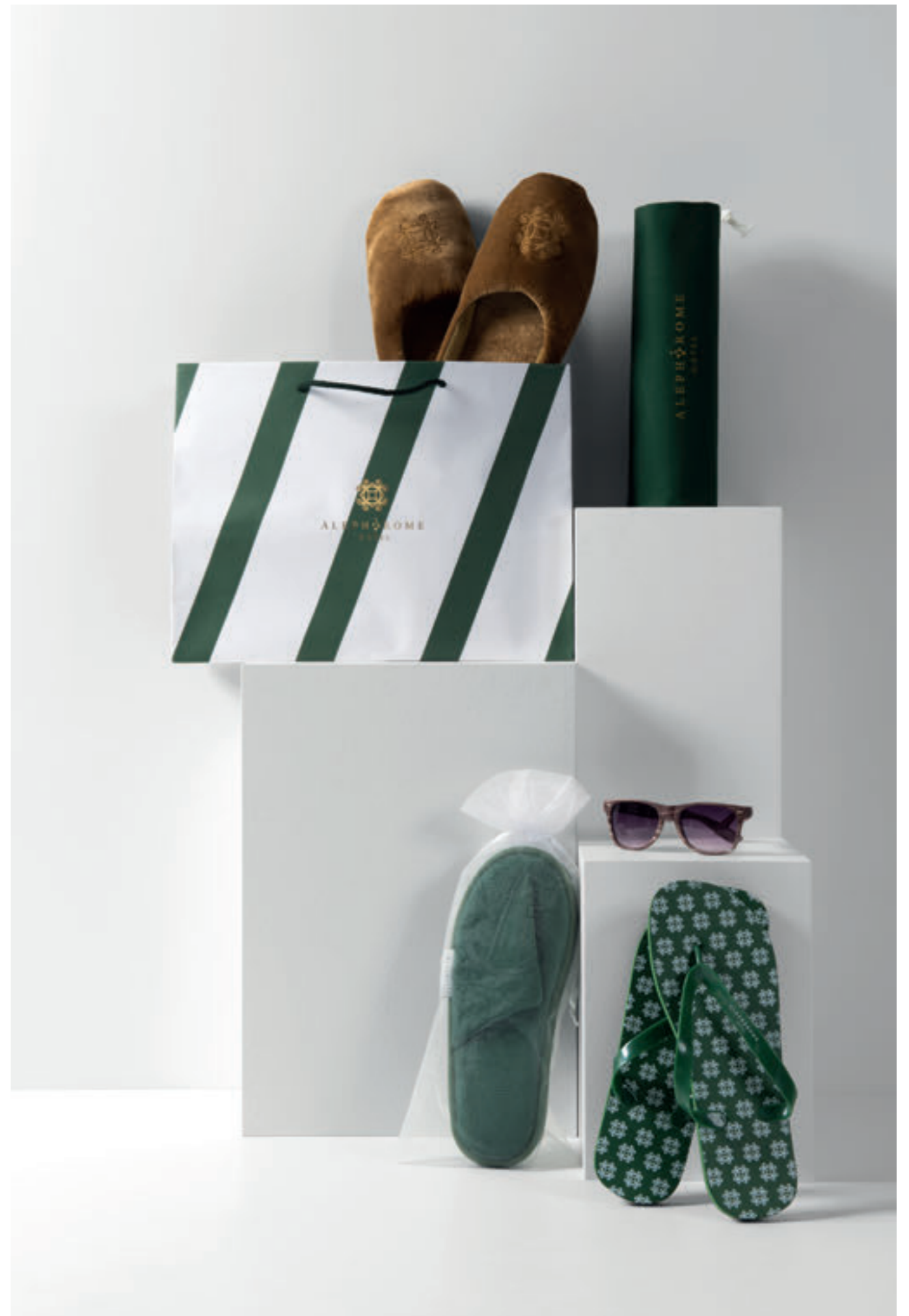
ALEPH ROME HOTEL, Rome