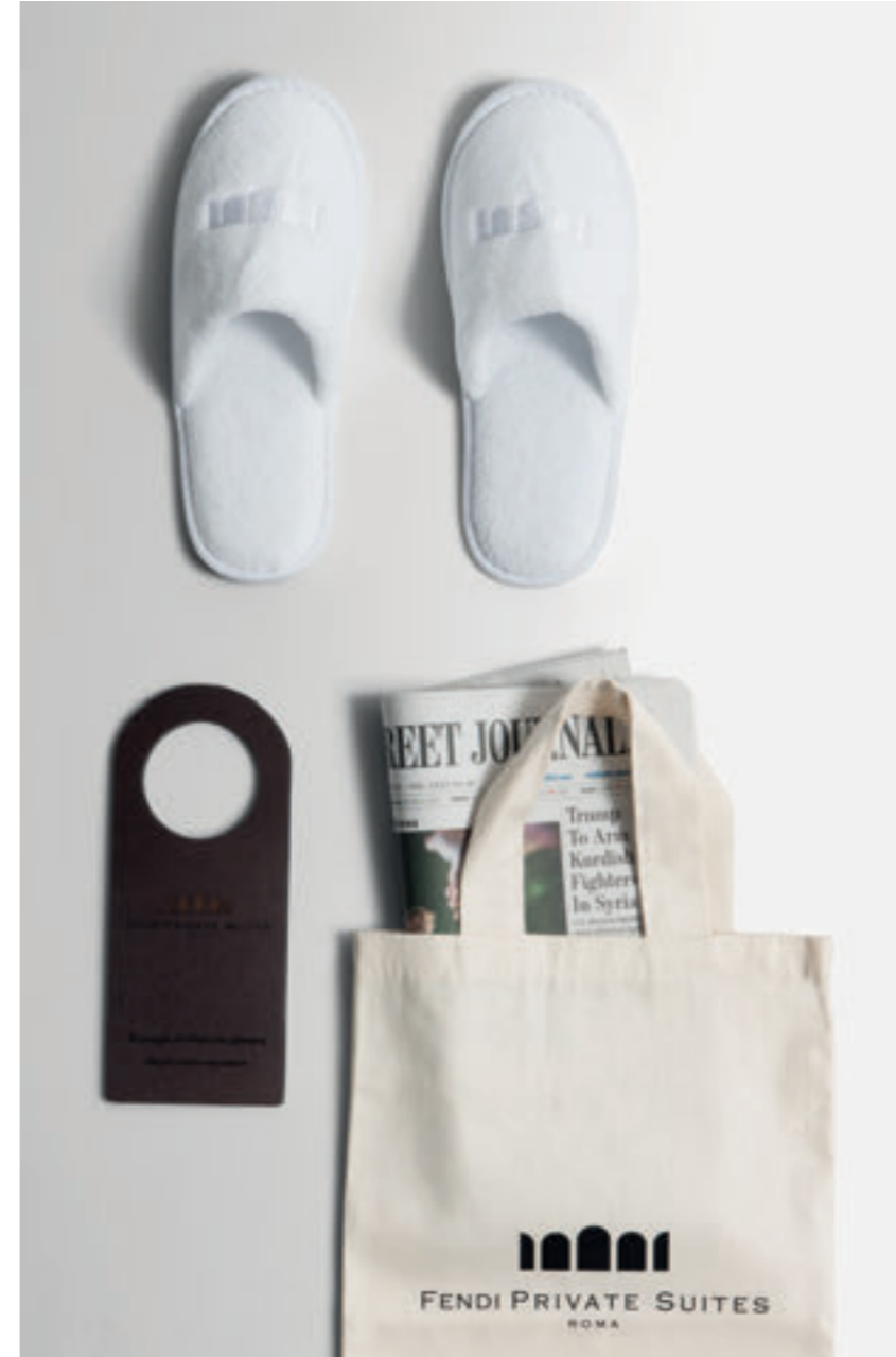
FENDI PRIVATE SUITES, Rome